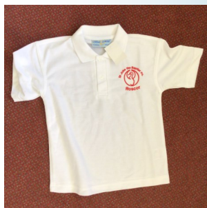
White crested t shirt