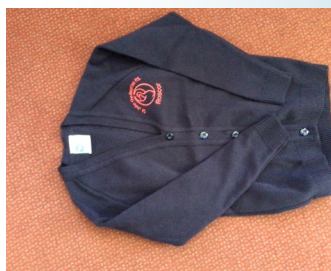
Navy crested kitted jumper