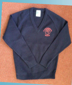
Navy crested jumper size