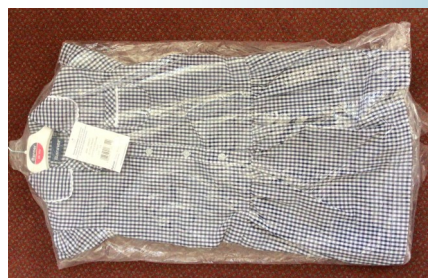
Navy gingham dress