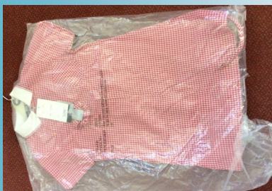
Red gingham dress £5