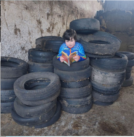
World Book Day