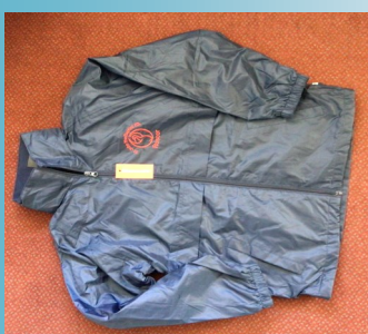
Navy Crested Rain Coat